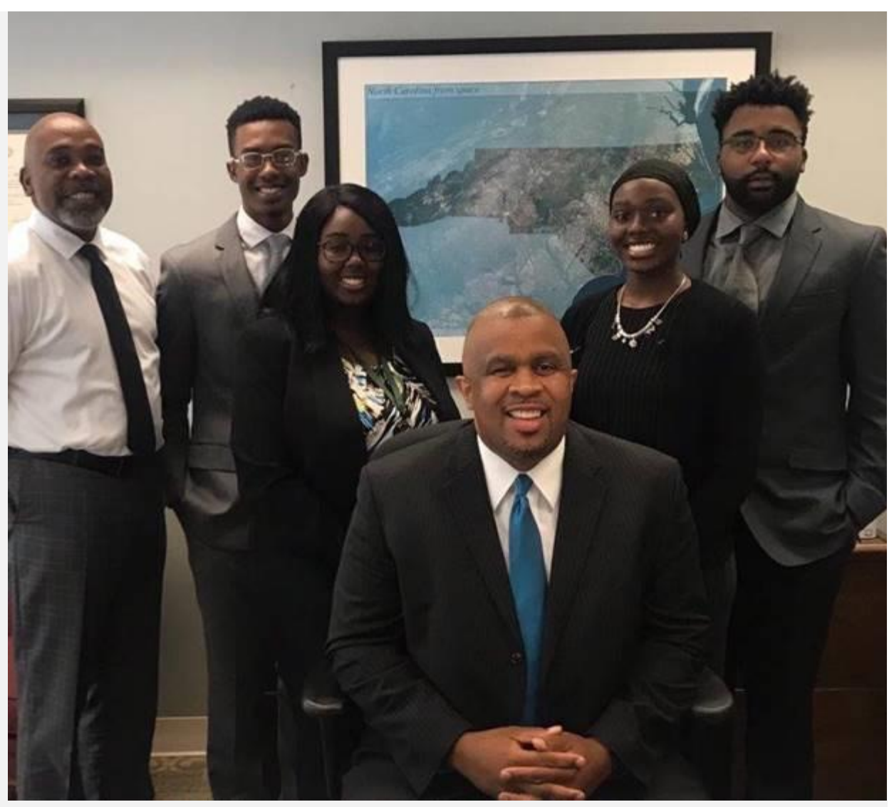
Please see this video on Virgin Hyperloop One.