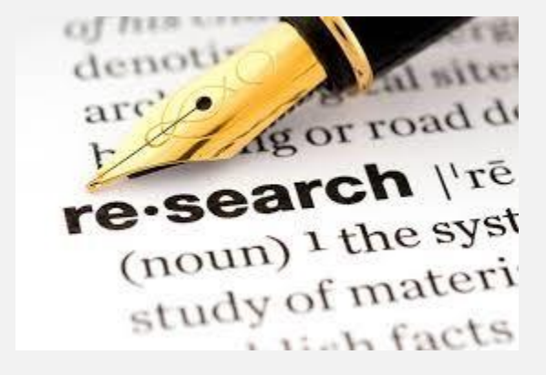
The N.C. Department of Transportation has selected research programs at three public universities to each receive $1 million grants to study future transportation challenges in N.C. and develop ways to improve safety and mobility.