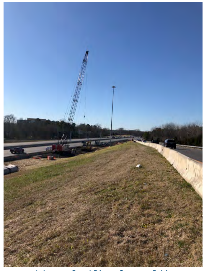
Johnston Road Direct Connect Bridge