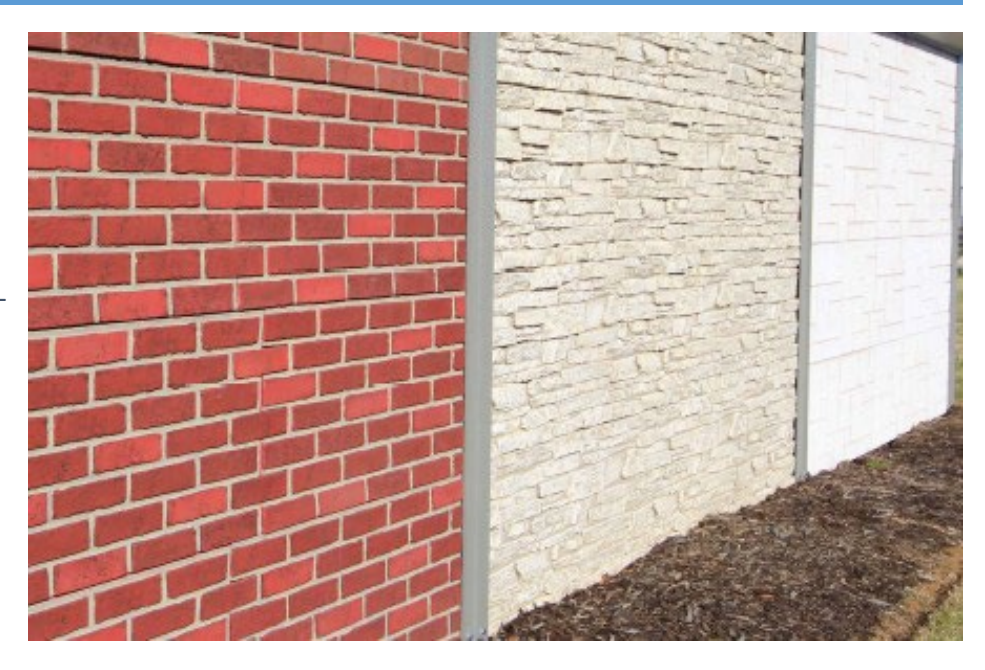
Image of various patterns the Aphrodite Sound Wall is capable of from VANQUISH Fencing Solution's product submittal document.

For more information, please visit <a href="http://vanquishfencing.com">http://vanquishfencing.com</a>.