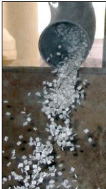
Ultrafiber 500® cellulose fibers being added into a concrete mix – image from Ultrafiber 500® brochure

UltraFiber 500® is manufactured by Solomon Colors Inc. out of Springfield, Illinois. It is currently under evaluation and listed on the Approved Products List (APL) as NP21-8901. UltraFiber 500® is an alkaline resistant cellulose fiber reinforcement admixture for concrete. It replaces traditional welded wire mesh in concrete and provides for increased bonding between the concrete fibers over traditional polypropylene fibers. Unlike polypropylene fibers, UltraFiber 500® is invisible in concrete, does not ball, fuzz, or blemish, and is derived from renewable resources. UltraFiber 500® reduces shrinkage cracking, provides increased strength, durability, is distributed throughout the concrete matrix to provide 3-dimensional reinforcement and unlike welded wire mesh, will not corrode. For more information, please visit: