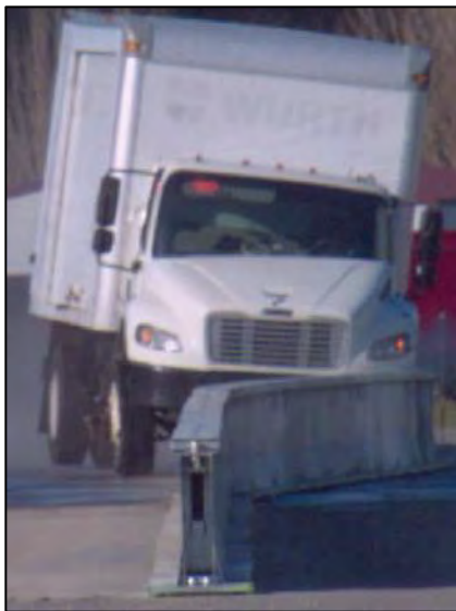
Example of a box truck colliding with, and being safely deflected by the HighwayGuard ™ system

The HighwayGuard ™ and HighwayGuard LDS ™ (Lowest Deflection System) are temporary/portable steel barrier systems intended primarily for work zone applications. The product is currently under evaluation and is listed on the APL as NP20-8707. The HighwayGuard systems are both Manual for Assessing Safety Hardware (MASH) 2016 TL-3 and TL-4 compliant. Both systems utilize the same metal barrier sections, but with differing pavement anchoring arrangements. The HighwayGuard system width ranges from 9 13 / 16 " at the top rail, up to a maximum width across the trafficable foot of 21 1 / 4 ". Each HighwayGuard module is 20 ft long and has a weight of 62 lbs./LF. For more information, please visit: highwayguard.com/