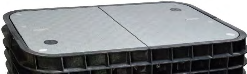
View of Bulk ® Utility Vault with gray SHIELD ™ Cover

The Bulk ® Utility Vault / Junction Boxes with SHEILD ™ Covers are currently Approved for Provisional Use for utility applications. They are listed on the Approved Products List as NP20-8960 and NP19-8584. They are manufactured by Channell Commercial Corporation in Rockwall, TX. While most Utility Vaults / Junction Boxes and their lids are composed of concrete or polymer concrete, these Utility Vault covers are composed of a cross-linked composite matrix of long strand glass fibers, polyester resin, proprietary organic minerals, gray color pigment and a UV inhibitor Package. This results in a significant weight reduction for these products, increasing the ease of installation and transportation without sacrificing strength. The SHEILD ™ composite lids exceed Tier-22 compliance requirements and have undergone 10,000 hours of Zenon Arc-lamp testing to simulate 20 years of UV degradation. For more information, please visit: www.channell.com