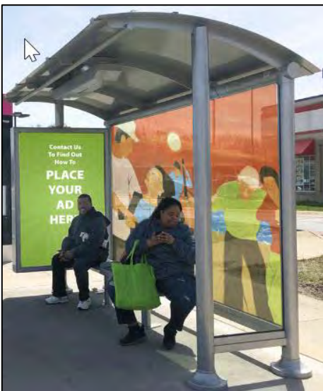
Example of Bus/Transit shelter with curved roof and advertising kiosk

Tolar Manufacturing Company, Inc. has several Transit and Bus Shelters listed on the APL. There are four shelters listed as approved for provisional use under their Niagara series line of products. The products are listed as NP15-7128, NP19-8398, NP19-8399, and NP20-8659. Tolar Manufacturing Company, Inc. designs and manufactures their products in Corona, California. All the approved shelters are designed to withstand maximum winds of 150 MPH. All shelters include a variety of options; including various roof lines and styles to suit any streetscape, bus benches, trash receptacles, glass treatments and wall panels, illumination options including solar and low draw LEDs. Shelters are available with or without advertising/media display kiosks. For more information, please visit: https://www.tolarmfg.com/