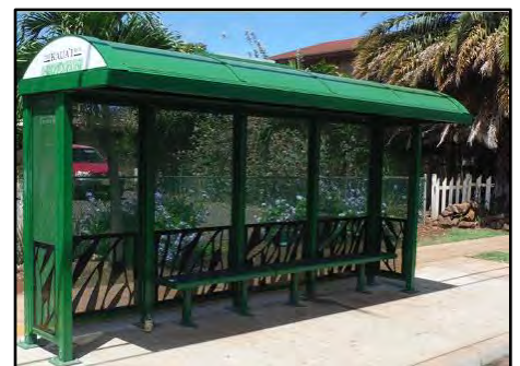
Example of a Bus/Transit shelter with dome roof

Tolar Manufacturing Company, Inc. has several Transit and Bus Shelters listed on the APL. There are four shelters listed as approved for provisional use under their Niagara series line of products. The products are listed as NP15-7128, NP19-8398, NP19-8399, and NP20-8659. Tolar Manufacturing Company, Inc. designs and manufactures their products in Corona, California. All the approved shelters are designed to withstand maximum winds of 150 MPH. All shelters include a variety of options; including various roof lines and styles to suit any streetscape, bus benches, trash receptacles, glass treatments and wall panels, illumination options including solar and low draw LEDs. Shelters are available with or without advertising/media display kiosks. For more information, please visit: https://www.tolarmfg.com/