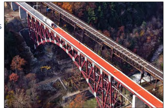
Aerial view of BDM being applied to a new railway bridge – image from BDM brochure

The Bridge Deck Membrane (BDM) system is used for waterproofing Railroad and Highway bridge decks with an asphalt overlay. It is currently under evaluation and listed on the Approved Products List as NP20-8728. It is manufactured by Bridge Preservation, LLC. in Kansas City, Kansas. BDM is a rapid setting (tack free in approximately 30 seconds), two-component polyurethane polymer membrane. The membrane is spray-applied and can be installed on horizontal, vertical, and overhead surfaces. BDM is highly durable as well as puncture, chemical, and abrasion resistant. The material can be installed in temperatures as low as -20°F without impacting the products cure time. For more information, please visit: bridgepreservation.com