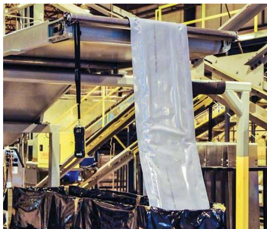
Example of pipe-liner coming off manufacturing line

Alphaliner is currently used by several other state DOTs. For more information, including an informative animated installation video, please visit www.relineamerica.com/uv-grp-products/