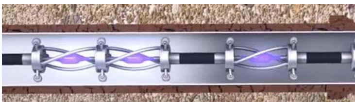
Computer animation of multi-section UV light tool “snake” curing pipe-liner in place – image from Reline America website

Alphaliner models 500 and 1500 are an ultraviolet-light cured, glass reinforced, cured in place pipe-liner (UV-GRP CIPP) that is approved for provisional use and is listed on the Approved Products List (APL) as product NP19-8203. The Alphaliner can be produced in sizes ranging from 6 to 72 inches in diameter, and can accommodate a variety of pipe shapes, ranging from circular, ovoid and arch, to rectangular and special cross-sections in that diameter range. It is manufactured in lengths of up to 1200 feet and is available in thicknesses of 4mm and 7mm. The product is installed by pulling the liner through the damaged pipe section, inflating and pressurizing the liner with air, and then pulling an ultra-violet light “snake” through the pressurized liner to cure the liner in place.