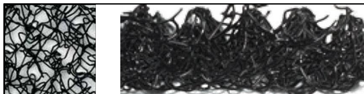
Futerra TRM (left side photo is plan view of TRM, right side is profile/side view of TRM)

The GreenArmor System 7020 was recently approved for Field Trial use and consists of the Futerra Turf Reinforcement Mat (TRM), and Flexterra HP-FGM (High Performance Flexible Growth Medium). It is listed on the APL as product NP19-8214, and is manufactured by Profile Products, LLC. The Futerra TRM is a ¾ inch thick, three-dimensional matrix made of continuous monofilament UV-stabilized nylon yarns which are thermally fused at the crossover points to provide structural stability. The TRM provides for 95% open space, which is then hydraulically filled with the HP-FGM. The HP-FGM is composed of wood fibers and biodegradable crimped interlocking fibers, additives, and seeds. The GreenArmor 7020 System has greater resistance to erosion than natural vegetation, and costs less than hard armoring (rock rip-rap) installations on slopes.