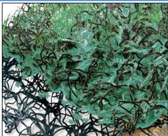
Futerra TRM (black fibers) with Flexterra HP-FGM (green fibers) hydraulically applied and grass growing at top of image – image from GreenArmor 7020 brochure

The GreenArmor 7020 has a critical shear and critical velocity in vegetated conditions of 17lb/ft 2 and 20fps, respectively; and in unvegetated conditions of 5.8lb/ft 2 and 16fps. For more information, please visit: www.profilevs.com/