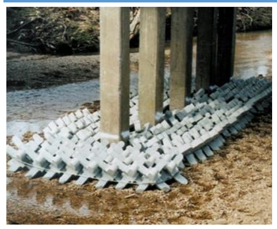
Example of A-Jacks installed for bridge scour protection

The A-Jacks Concrete Armoring Units are approved for provisional use and are listed on the Approved Products List as NP17-7926. They are designed and manufactured by Contech Engineering Solutions (A Quikrete Company). The A-Jacks can be installed either randomly or in a uniform pattern. The units provide for both erosion protection, and marine habitat. The voids formed within the A-Jacks matrix can provide up to a 40% open space in the uniform placement pattern. These voids can provide habitat for fish and other marine life when applied as a reef, revetment or as a soil support system in river/stream applications. In addition, the voids may be backfilled with suitable soils and planted with a variety of