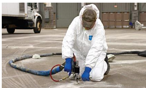
Example of leveling an uneven slab by injecting TerraThane – image from NCFI website

TerraThane 24-003 has been used in highway projects in other states, and was recently used at the New Bern, NC Riverfront Convention Center to level slab settling caused by poor subsurface conditions. For more information, please visit: www.ncfi.com/solutions/geotechnical/