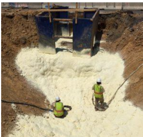
TerraThane used as soil stabilization and fill

TerraThane 24-003 is a hydrophobic polymeric two-component closed-cell MDI based polyurethane. It is primarily used to lift and level concrete slabs, stabilize soil, slab/panel undersealing, and to fill voids under slabs and behind culvert walls. TerraThane 24-003 has an in-place density of 5-6 pounds per cubic foot and reaches 90% of its 100-psi compressive strength within 15 minutes. It can be applied in either dry or wet conditions and is injected through 5/8" holes that are drilled and laid-out in a predetermined grid pattern. TerraThane 24-003 is manufactured by NCFI polyurethanes and is listed on the Approved Products List (APL) as NP19-8496.