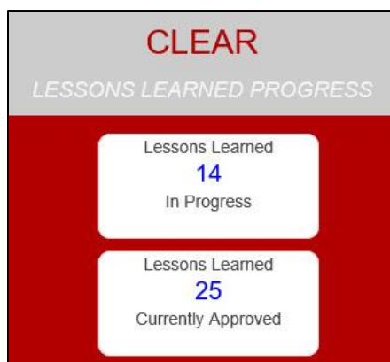
CLEAR Lessons Learned Counter – image from CLEAR website on NCDOT Connect

The CLEAR database was launched in June of this year; CLEAR stands for Communicate Lessons, Exchange Advice, Record. Its purpose is to breakdown existing barriers to communication, and retain lessons learned in a centralized easily searchable database that everyone within NCDOT can contribute to and learn from. Lessons include any idea, solution, problem encountered, best management practice, innovation, suggestion, experience or knowledge encountered by NCDOT personnel. CLEAR will allow NCDOT to better communicate and share knowledge between employees across divisions and units. CLEAR will also facilitate the retention of institutional knowledge by legacy employees before they retire from NCDOT and convey that information to junior employees. Once a lesson is submitted, an expert review panel reviews and refines the lesson submission before they are approved. CLEAR visibility workshops and training are currently being conducted on an as needed basis. The CLEAR database is open for submissions and is being updated and refined as new information is acquired and additional functionality is built into the system.