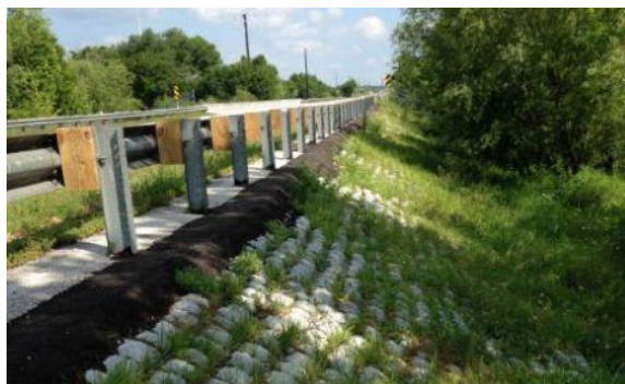
Flexamat installation after three months – image from Flexamat website.

Flexamat Permanent Erosion Control is currently being evaluated for inclusion on NCDOT's approved products list. The purpose of this product is to reduce erosion and promote sustainable vegetative growth when placed on roadway slopes, along ditches, channels, riverbanks, ponds, and shorelines. Flexamat is composed of evenly spaced concrete blocks (6.5" square x 2.25" high) that are held together by a polypropylene geogrid. The standard Flexamat backing is the Curlex II Aspen Wood blanket manufactured by American Excelsior Company. Different backings are available, including a permanent non-vegetative option that is manufactured from recycled plastic soda bottles. Flexamat rolls weigh approximately 10 lbs/SF and in most instances the mats do not have to be staked down.