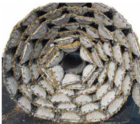
Flexamat roll for delivery

Flexamat rolls are manufactured in standard widths of 4', 5.5', 8', 10', 12', & 16' and standard lengths of 30', 40', & 50'. Custom width and lengths, as well as 4' x 4' mats stacked on pallets are also available. The non-vegetated limiting shear and velocity are 24+ PSF, and 30+ ft/sec, respectively.