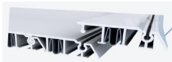
Example of pipe liner interlocking point – image from Sekisui SPR website

The SPR Spiral Wound trenchless pipe rehabilitation system (listed on the APL as NP19-8460) is produced by Sekisui SPR and works with both circular and irregular pipe shapes and pipe diameters between 6 and 217 inches. The continuous PVC liner is progressively wound into the pipe from a spool above ground while the winding equipment traverses the pipe. The sections of liner are interlocked together by the winding equipment, and then the space between the liner and pipe wall is grouted. The lining system can operate in partial flow conditions, negotiate curves and bends, and has an option for adding in additional steel reinforcement prior to pipe grouting.